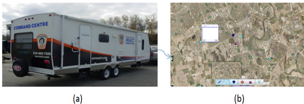
Figure 1: (a) REACT's mobile command center (b) Interactive Wall Display

Waterloo Regional REACT (REACT) is a volunteer-based emergency services organization, operating continuously since 1972, that has a clear three-part mission: 1) to provide a safety umbrella to participants and members of the public at community-sponsored events; 2) to provide effective and reliable volunteer support to emergency services in times of need; and 3) to provide specialized emergency support equipment and trained volunteer operators to emergency services for use in times of need. REACT is a unique organization that provides an opportunity for the proposed research to have a direct and significant impact on the community in the Regional Municipality of Waterloo, the community-based organizations that REACT supports, and various emergency service agencies such as police, fire, and emergency medical services (EMS).