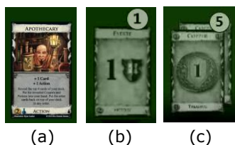
Figure 3. Card visualizations in the Dominion game: a) a normal card, b) an Object Shadow of a single card, and c) an Object Shadow for multiple cards.