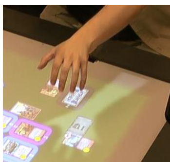
Figure 4. Object-plus-Arm Shadow feedback.

and disappearance, and a short animation moves the card from its original location to the center of the user's hand (which is more robustly tracked than the fingers).