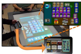
Figure 2. Game setup.

interaction techniques that enable digital content to be transferred between devices, ideally with minimal interference to the ongoing task activity. Rekimoto's Pick-and-Drop (PND) [4] object transfer technique has been widely adapted to this context [e.g. 2, 3]. PND is an extension of the drag-and-drop concept. A user "picks-up" an object with a stylus, and then "drops" it on a different computer display. A limitation of the PND technique is that objects are invisible during the transfer: they are no longer on the source display, but not yet on the target display. Thus, users can lose track of the transfers progress, both their own and other users' transfers, particularly during complex transfers (e.g. multiple object), when technical issues interfere with the transfer, or when distracted [2].